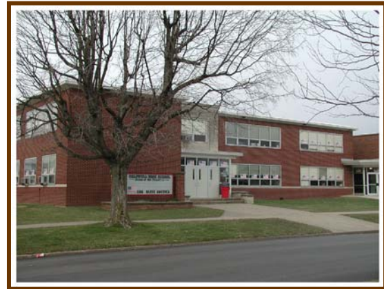
Caldwell High School, Caldwell

Providing opportunities for Noble County residents of all ages and interests to build and further their education is a community priority. Curriculum tracks meet the needs of both college and workforce bound students. Citizenship and knowledge of the local community are taught through the schools and parents participate actively in their children's education. For youth, the educational and extracurricular opportunities available through the local schools provide both quality and the ability to serve a wide variety of athletic and educational interests.