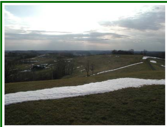
View from Everly-Sanford Farm

Noble County is a sparsely populated community. It is made up of small towns, active townships and open areas. The size of this community encourages neighbors to know each other, to work together and to care for each other's well being. The closeness is demonstrated historically as residents' aid each other during disasters like the area flood of 1998. Each community enhances the feeling of a safe, courteous and friendly community.