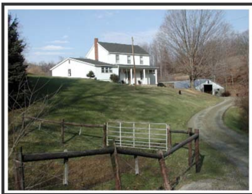
Lorin Sanford Farm, Caldwell

Quality, full-service day care is easy to obtain. All residents and businesses have access to adequate water, sewer and electric power in the county. Appropriate land usage is identified through countywide planning that is supported by locally controlled zoning. Noble County encourages small business success and start-ups by providing financing, incentives, incubators and help in identifying markets. Many tourists choose Noble County as a destination because of its natural beauty, recreational opportunities and quality tourism amenities such as hotels and other accommodations. Noble County is a common destination for retirees providing health care and housing appropriate to a retirement community. Natural resources play a major part in the vitality of the tourism