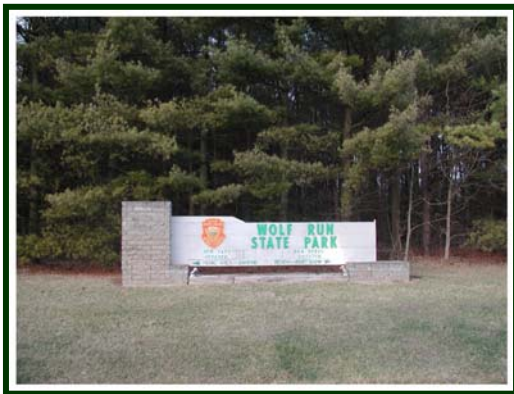
Wolf Run State Park, Belle Valley Area

Noble County is a place blessed with natural beauty. Public places like Wolf Run State Park, Duck Creek, and Ohio Power land are pieces of Noble County's natural environment, which need to be cared for and preserved. Similarly, the hills, trees, streams and rich soil owned and cared for by private citizens also are respected for their contribution to the areas unique natural environment. Each of these areas contributes to the beauty of a healthy eco-system that sustains each resident of this community. Each location contributes to the clean-air, water resources and aesthetic spirit that enriches resident's lifestyles.