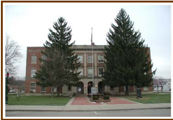
Noble County Courthouse, Caldwell

Noble County residents find modern, quality services within an environment of traditional small town values and qualities. Wide ranges of health care services are available, including elderly care, fitness centers, a hospital with 24-hour emergency care and numerous private practitioners. Emergency services, including 911, fire and police, are well equipped and trained. Public pools and community centers are available for township residents. Residents and small communities are given the same