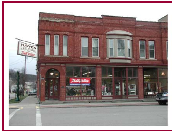
Hayes Hardware, Caldwell

ventures that provide a livelihood for themselves and their employees. Family farms dot the countryside, retail and service businesses enrich each small town and small manufacturing facilities create quality products. Regardless of the business sector it is the small size of the firm that has created employment opportunities in the County community while maintaining a rural standard of living. Recently, into this mix a state prison facility has added employment opportunity and brought new residents into the area while respecting the small business climate of our community.