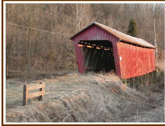
Parish Bridge, Sharon Township

The events and lifestyle that effected past generations are visible today in historic structures and areas like covered bridges, the wreck of the Shenandoah and Johnny Appleseed Memorial. Similarly, buildings such as the of Caldwell, including and Jail, connect past, generations to a shared places and historic discovered need to be and future generations richness of this time