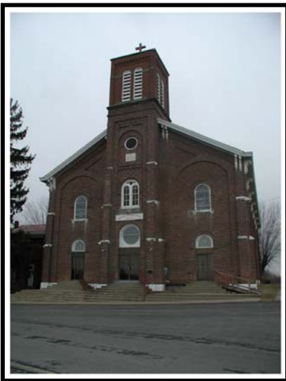
St. Mary's Catholic Church, Fulda

Noble County is a faith-based community. Throughout its history residents have enjoyed the opportunity to join in communities of interest to worship and learn as they chose. The experiences found within these faith-based communities of interest carries into the daily lives of residents as they commit themselves to quality schools, a caring community, family focused activities and stewardship of the natural environment.