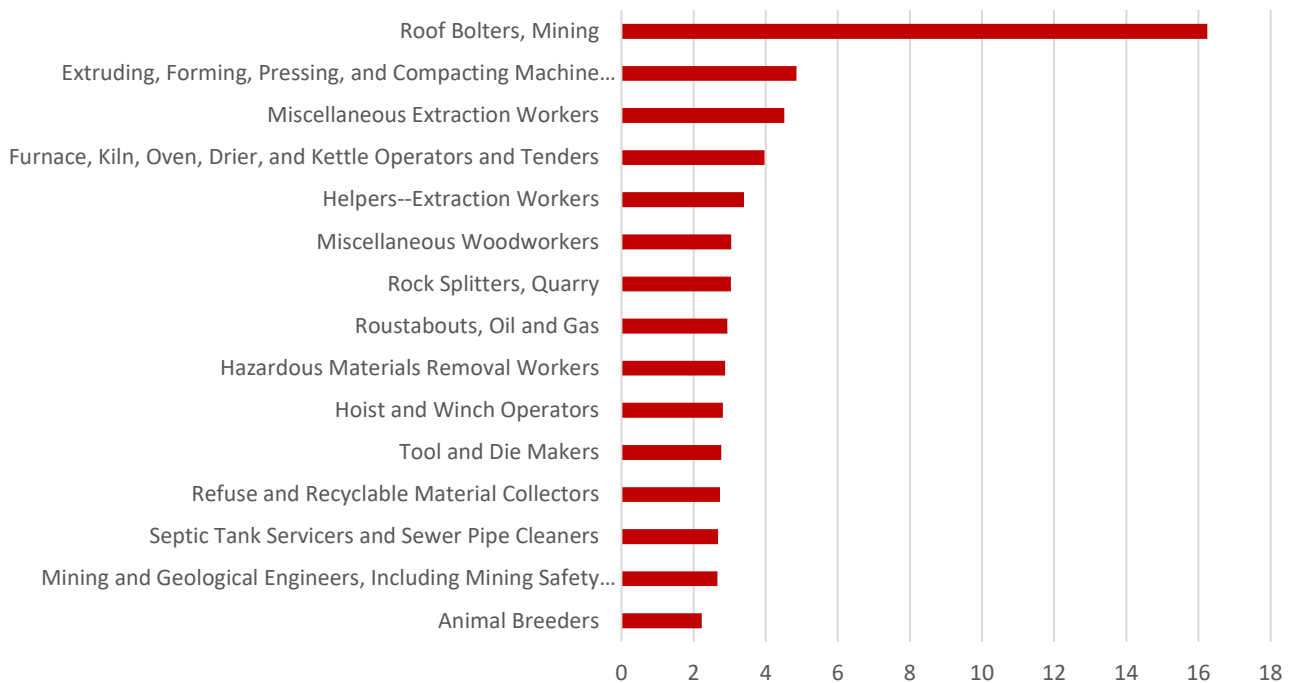
Chart 1: Occupation Location Quotient

Where there is an occupational concentration, there also tends to be higher core competencies relative to other areas, creating a competitive advantage. In addition, training and education opportunities associated with the occupation are often readily available to meet hiring demands. Three of the highest-ranking occupations had average hourly wages for these jobs ranging from $23 to $36 per hour.