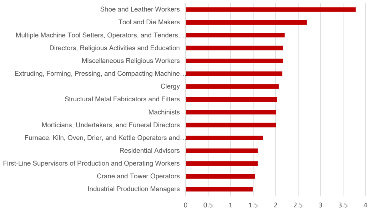
Chart 1: Occupation Location Quotient

Where there is an occupational concentration, there also tends to be higher core competencies relative to other areas, creating a competitive advantage. In addition, training and education opportunities associated with the occupation are often readily available to meet hiring demands. Three of the highest-ranking occupations had average hourly wages ranging from $18 to $38 per hour.