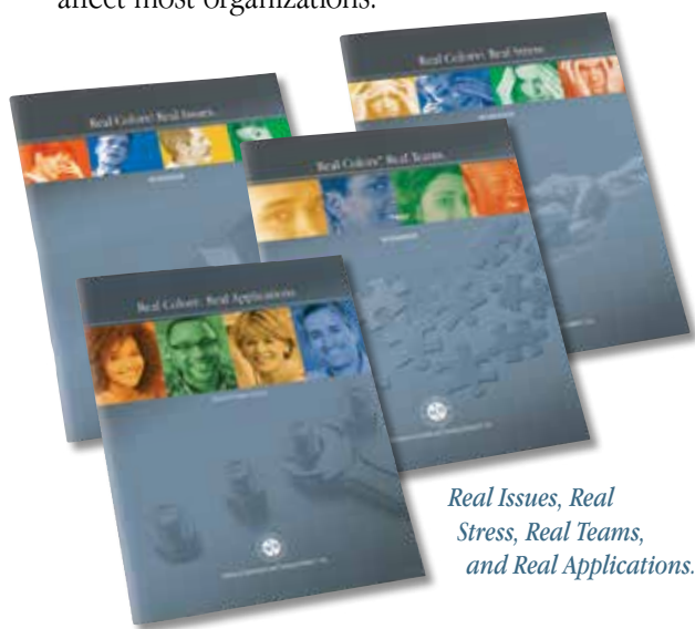
Real Issues, Real Stress, Real Teams, and Real Applications.

As a Real Colors facilitator, you will have the ability to purchase and deliver the Real Colors Personality Instrument, as well as our Advanced Training Modules that have been specifically designed to address the everyday issues that affect most organizations.