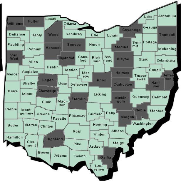
BR&E SINCE 2003